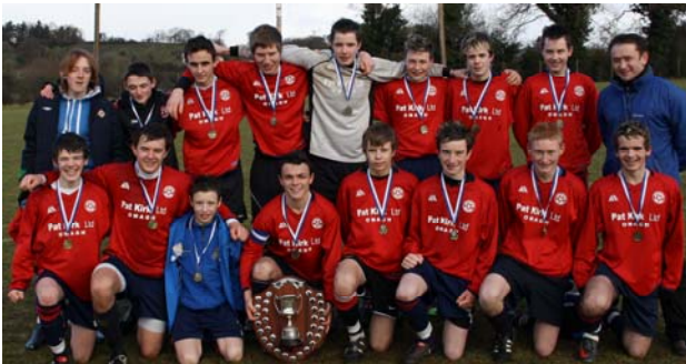
The U16 team which won the McKee Cup beating Lisnaskea High School in the final.