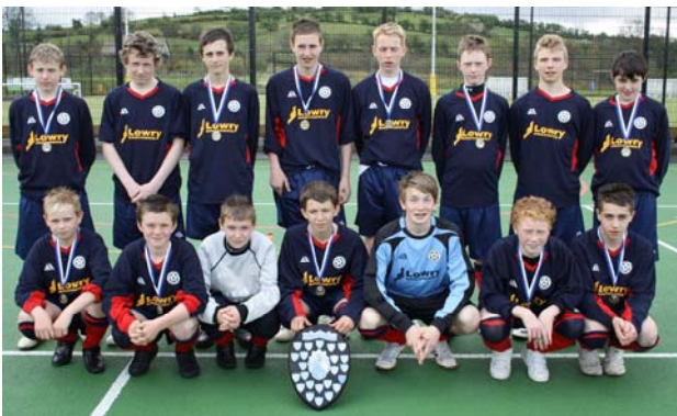
U14 team which won the McMullan Shield beating Drumragh College in the final.