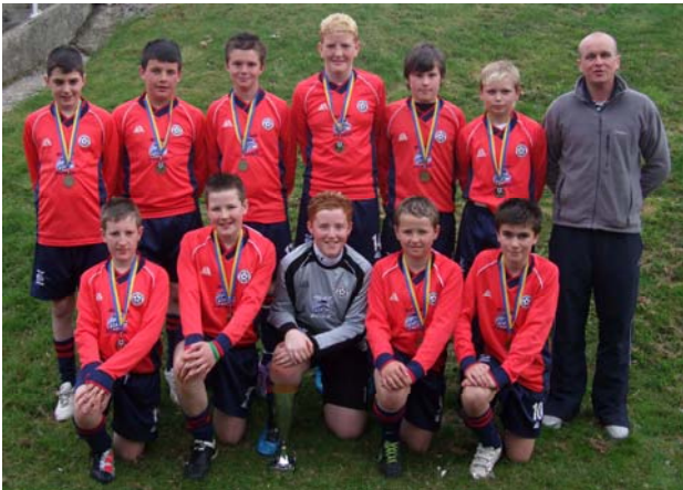
Year 9 team which won the Fermanagh and Western Blitz beating Omagh High in the finals.